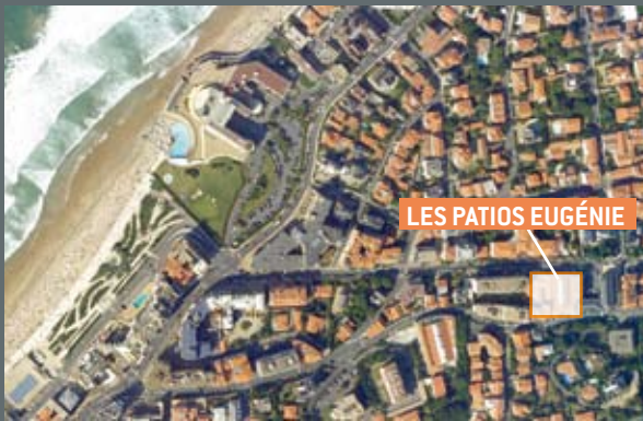
LES PATIOS EUGÉNIE